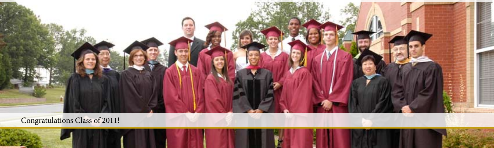
Congratulations Class of 2011!